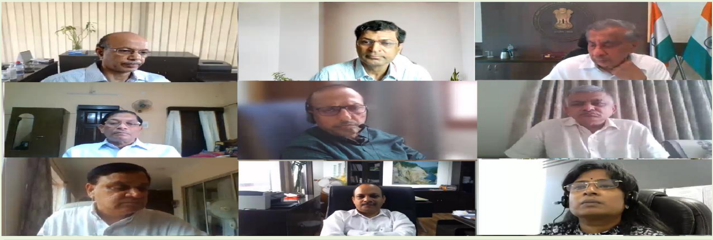
22<sup>nd</sup> Annual General Body Meeting of FOIR on 18<sup>th</sup> June, 2021 at 11:45 AM onwards

• For Minutes of 48<sup>th</sup> Governing Body Meeting (GBM) of FOIR Click Here